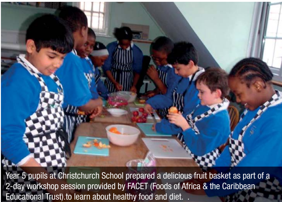
Year 5 pupils at Christchurch School prepared a delicious fruit basket as part of a 2-day workshop session provided by FACET (Foods of Africa & the Caribbean Educational Trust).to learn about healthy food and diet. .

Wandsworth has grouped 15 schools together to form the Battersea Cluster so that they can work together and involve local communities.