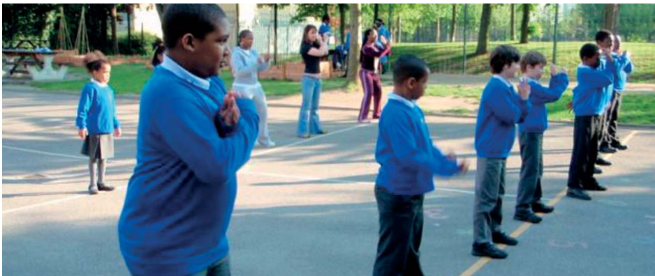
Parents and pupils at Christchurch school take part in the morning Tai Chi session run by Fit4Kidz