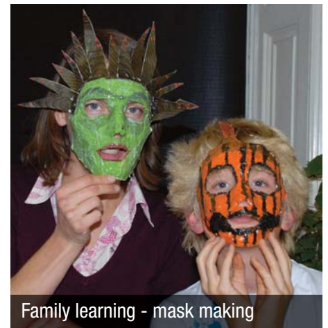
Family learning - mask making